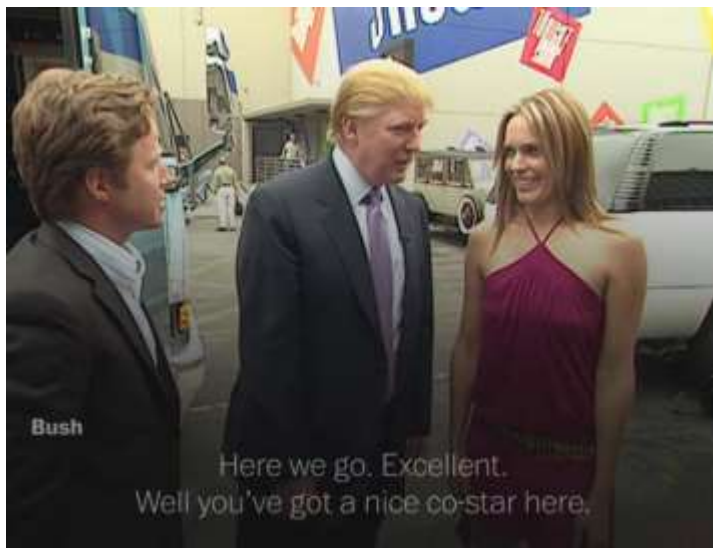
1 Trump with Hollywood Access stars immediately after taped comments.

I'm automatically attracted to beautiful—I just start kissing them. It's like a magnet. Just kiss. I don't even wait. And when you're a star, they let you do it. You can do anything. Grab 'em by the pussy. You can do anything. 19,20